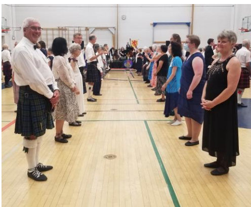
The Light & Airy editor about to dance Light & Airy at the Summer School Ball!